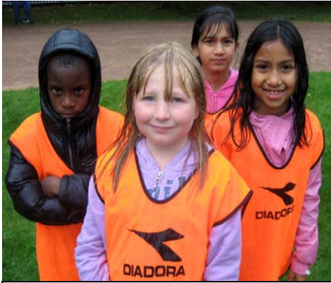
Sports Day at The Hub was very wet!