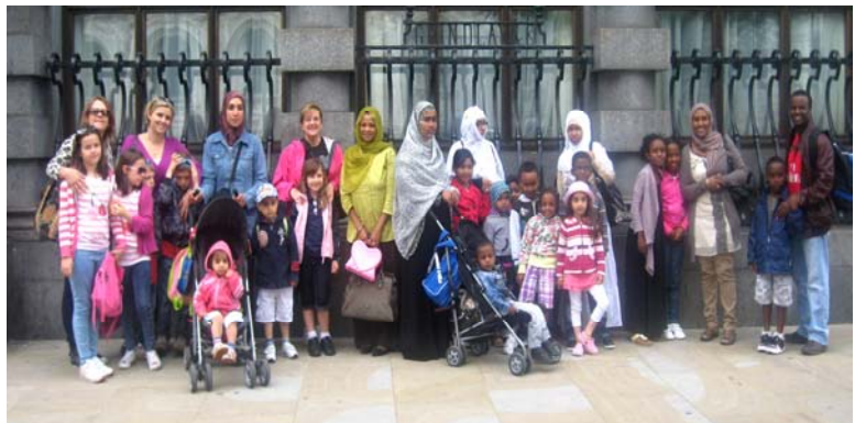
The Boat Trip down the River Thames from Westminster Pier to Greenwich