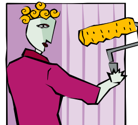
SMALL DIY JOBS